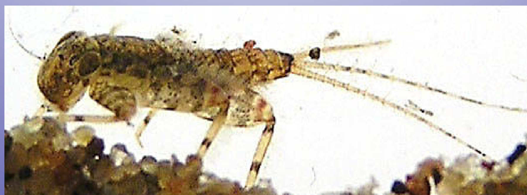
Fig. 2. A mayfly larva, Maccaffertium sp.