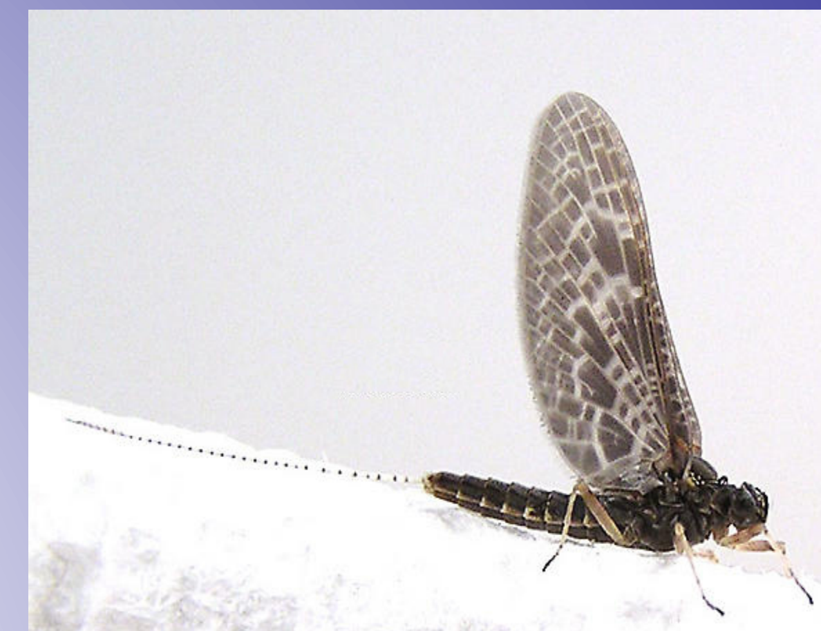
Fig. 3. A mayfly subadult, Callibaetis sp.