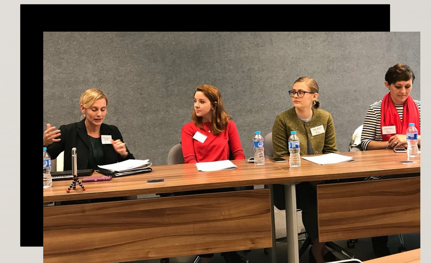
Presenting at the Sylvia Plath Conference, Ulster University