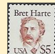
Fig. 2--$5 Bret Harte stamp August 25, 1987, of the Great American series.

Fig. 7-- February 13, 1940, 10-cent stamp honoring Samuel Clemens, Famous Americans series.