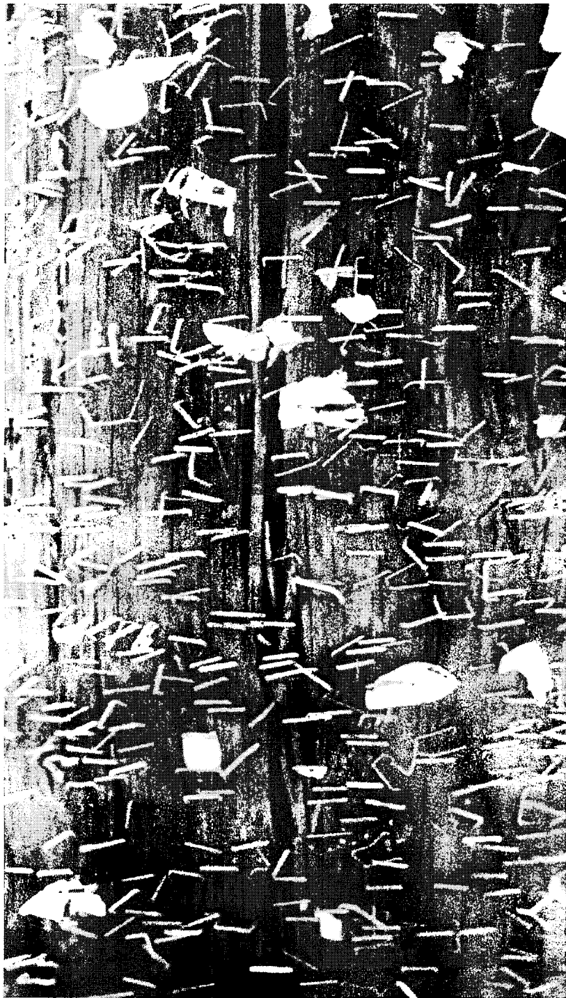
Utility Pole Brad Whetstine