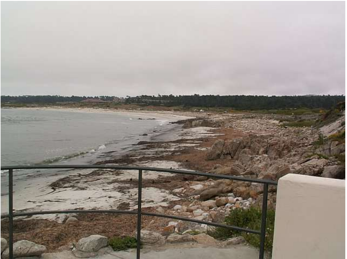
Spanish Bay, Pebble Beach, CA Matt Rothrock