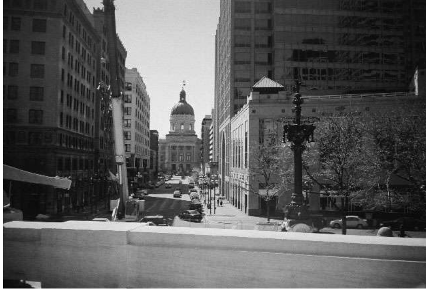
The Indiana State Capitol, from the Soldier's and Sailor's Monument Indianapolis, Indiana